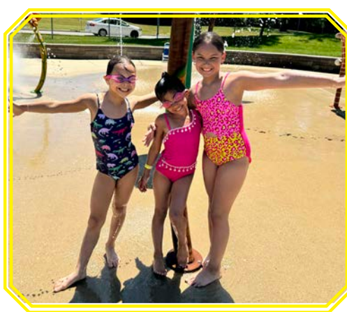
*Regular Fees apply